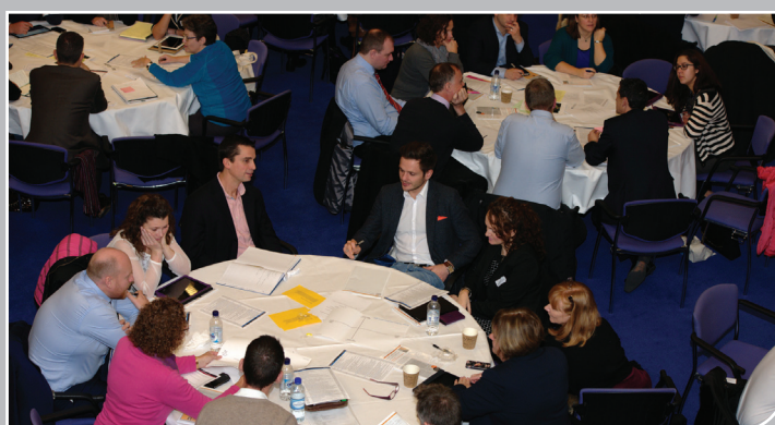
Last year's National Conference: Delegates enjoyed time to network with colleagues from other schools between sessions.